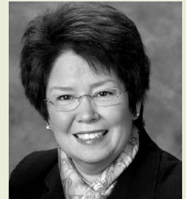
Senator Yvonne Prettner Solon-Duluth (7)